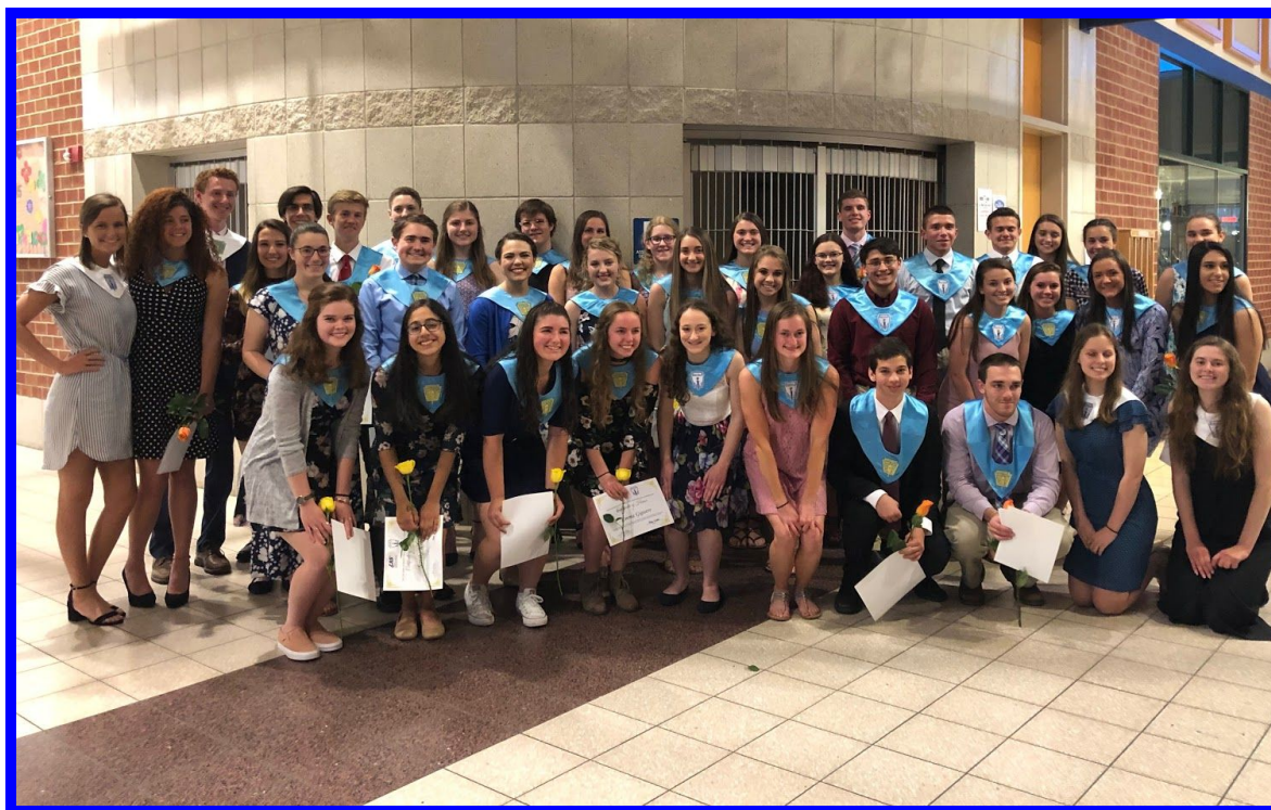
Pictured above: 21 new members of the National Honor Society were inducted on May 7.