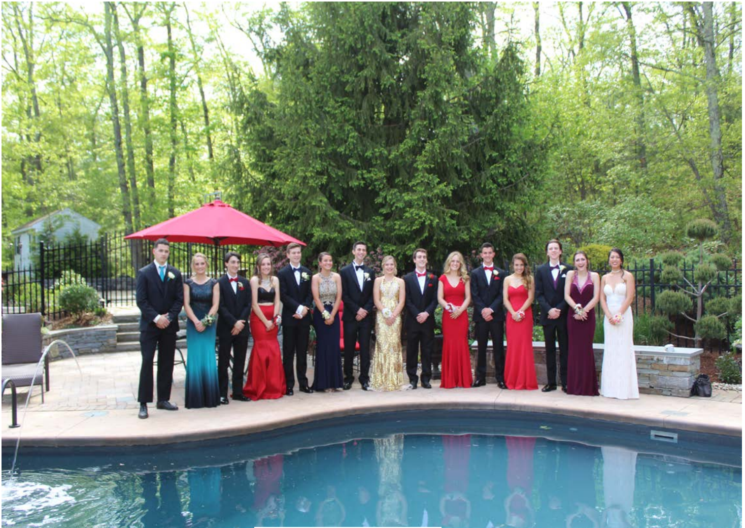
Tolland High School Students Enjoying the Prom

June 5. Breakfast is at 9:00 am at the Board of Education Office. I hope to see you there!